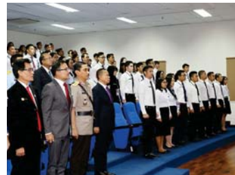
Strengthening Program of National Values for MoFA Diplomats Batch 2 page 8