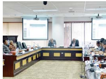
Lemhannas RI Convenes Roundtable Discussion on National Defence Industry page 6