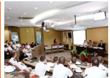
France's Amphibious Assault Ship Students Officers and Naval Command BPC Dixmude Pay Visit to Lemhannas RI page 10