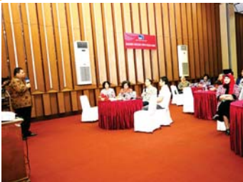
Commemorating National Awakening Day with Mental Revolution Message page 3